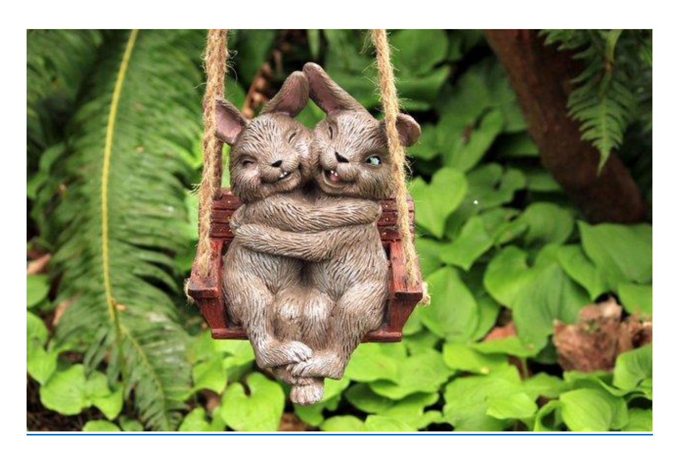
VIU's Milner Gardens Bunny Trail April 19 to 22, 2019

Bring the children or grandchildren for a children's Easter Bunny search taking place in the Gardens. At the Welcome & Interpretive Centre, children can pick up maps for clues to spotting the bunnies, and then return the map to the Pool House Gift Shop to receive an Easter treat.